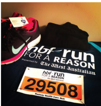
HBF Run for a Reason

At the RFDS, we like to call peer to peer fundraisers 'heroes' and 'sponsors'. A hero is a supporter who participates in a fundraising activity or event, like a fun run. Their sponsors are supporters who donate to the hero's cause. RFDS is proud to be a beneficiary in many peer to peer fundraising events such as the following: