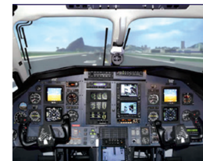
PC-12 Level D Simulator interior

The RFDS Aero Medical & Aviation Training Centre of Excellence will also include the Hypoxia Training