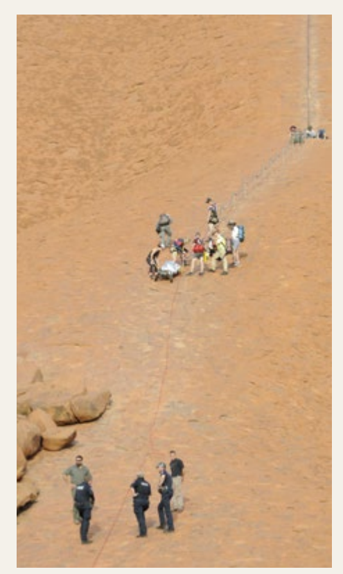
Kevin suffered a cardiac arrest whilst holidaying in the outback.

Donate today at flyingdoctor/sant/donate or call (08) 8238 3333.