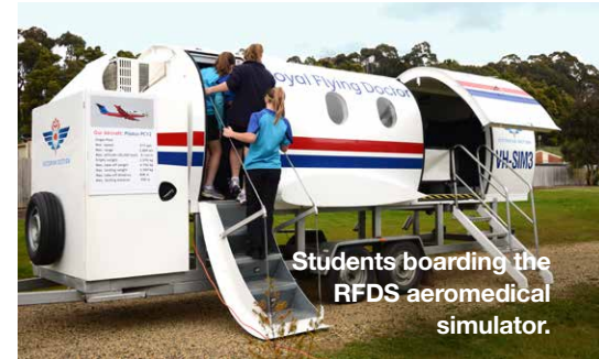
Students boarding the RFDS aeromedical simulator.

We thank RFDS Victoria for their continuing support to help lift the profile of the service in Tasmanian primary schools and their parent communities.