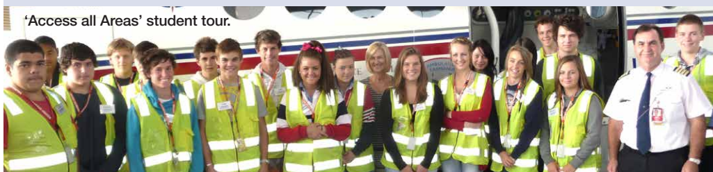
‘Access all Areas’ student tour.

students visited the base to learn about becoming a RFDS pilot and engineer. In addition, the students were given a behind-the-scenes tour of the Launceston Airport, Air Traffic Control and the Launceston Aviation Rescue and Fire Fighting unit.