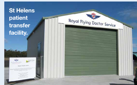
St Helens patient transfer facility.