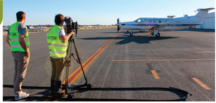
> Filming the aircraft at sunset.

Qantas launched the series at Tropfest on 8 December 2013 and since then the films have appeared as part of the Qantas in-flight entertainment and in movie theatres.