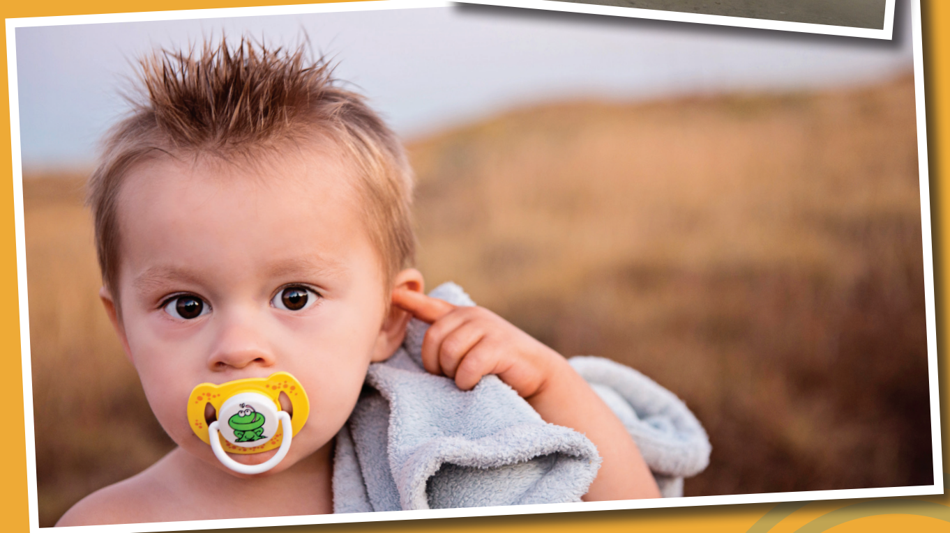
Oakley is now fully recovered >