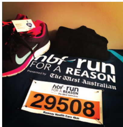
HBF Run for a Reason

At the RFDS, we like to call peer to peer fundraisers 'heroes' and 'sponsors'. A hero is a supporter who participates in a fundraising activity or event, like a fun run. Their sponsors are supporters who donate to the hero's cause. RFDS is proud to be a beneficiary in many peer to peer fundraising events such as the following: