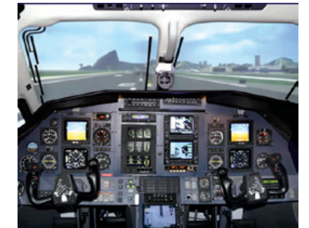
PC-12 Level D Simulator interior

As the need for our services continues to grow, the facilities at the Jandakot base need to accommodate this growth. This includes the expansion of operational facilities including hangars to accommodate the Pilatus PC-24 jets for engineering and maintenance, as well as a state of the art state-wide Coordination Centre and the Aero Medical & Aviation Training Centre of Excellence.