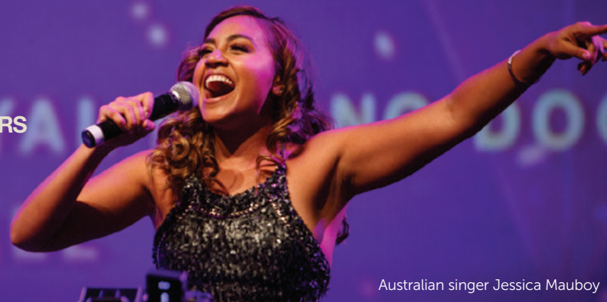
Australian singer Jessica Mauboy

WE WOULD LIKE TO ACKNOWLEDGE THE GENEROSITY OF OUR SPONSORS AND EVENT SUPPORTERS, WITHOUT WHOSE HELP THE EVENT WOULD NOT BE THE AMAZING SUCCESS IT IS.