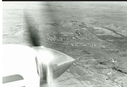
1970 Flying Doctor plane approaching Balgo Hills (Wirrimanu community). One of Australia's most remote communities in WA on the edge of the Great Sandy and the Tanami deserts.