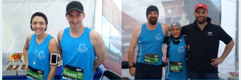
A record number of supporters came together to raise money for the Flying Doctor at Run Melbourne.

Held on July 29, the 11th Run Melbourne was a resounding success for the team with the Flying Doctor Ground Crew raising more than $10,000.