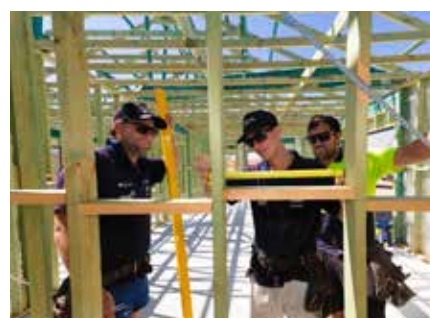
Construction of our Flying 1000 charity home in Busselton