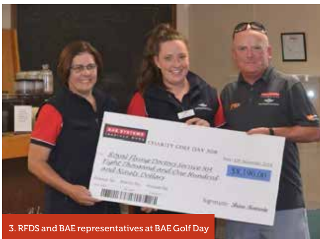
3. RFDS and BAE representatives at BAE Golf Day