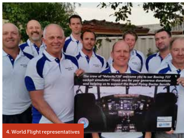
4. World Flight representatives