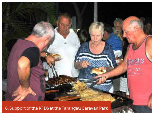
6. Support of the RFDS at the Tarangau Caravan Park