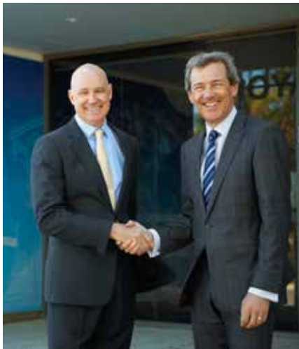
The CBH RFDS partnership is strong

This support will enable the RFDS to continue to provide life-saving services to almost 70,000 Western Australians each year.