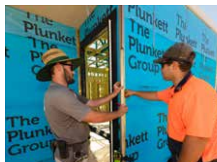
A charming four-bedroom, two-bathroom home built by Plunkett Homes