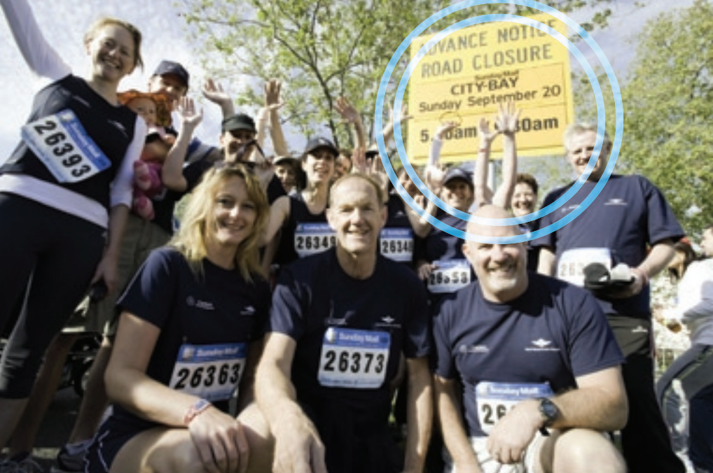
Team RFDS participants rally together at this year's City-Bay Fun Run.