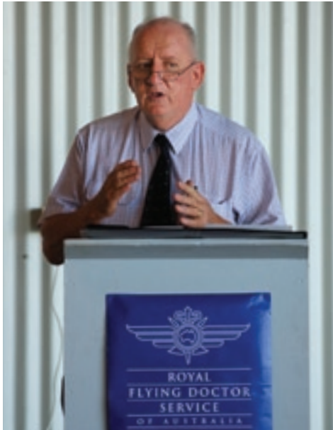
Tim Fischer AC addressing guests at the RFDS Alice Springs Base during his 'Flying into the Future' national tour in August.

IT IS WITH SOME SADNESS that I formally confirm I will step down as National Chair of the Royal Flying Doctor Service (RFDS), in November. This follows the unexpected posting to be Australia's first Permanent Representative to the Holy See, announced by the Prime Minister Kevin Rudd recently.